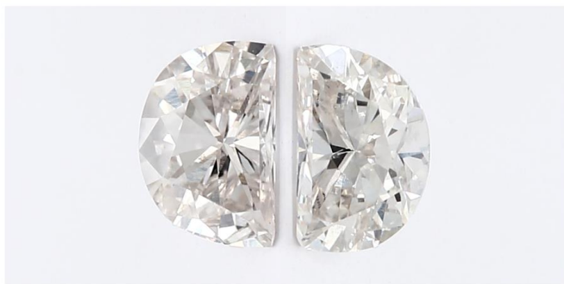
Matched Pair of Lab Grown Diamonds with a Total Weight of 0.61 ct(s)

*Comment: These man-made diamonds were grown in a laboratory and have the same chemical, physical, and optical properties as natural earth mined diamonds.