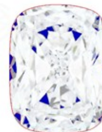
Optical Brilliance Excellent

Brilliance is the overall return of light to the viewer. The brilliance image is a representation of (a) white areas of light return, or brilliance, and (b) dark-blue areas of light loss.