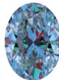
Optical Symmetry Very Good

The colored areas of the symmetry image are indications of light handling ability, giving a visual representation of proportions and facet alignment.