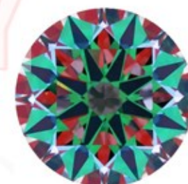
Optical Symmetry Excellent

The colored areas of the symmetry image are indications of light handling ability, giving a visual representation of proportions and facet alignment.