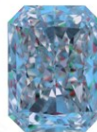
Optical Symmetry Good

The colored areas of the symmetry image are indications of light handling ability, giving a visual representation of proportions and facet alignment.