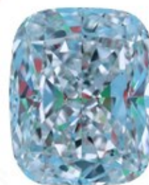
Optical Symmetry Good

The colored areas of the symmetry image are indications of light handling ability, giving a visual representation of proportions and facet alignment.