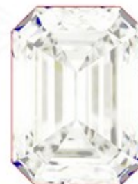
Optical Brilliance Excellent

Brilliance is the overall return of light to the viewer. The brilliance image is a representation of (a) white areas of light return, or brilliance, and (b) dark-blue areas of light loss.