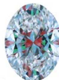
Optical Symmetry Very Good

The colored areas of the symmetry image are indications of light handling ability, giving a visual representation of proportions and facet alignment.