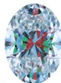
Optical Symmetry Very Good

The colored areas of the symmetry image are indications of light handling ability, giving a visual representation of proportions and facet alignment.