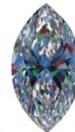
Optical Symmetry Very Good

The colored areas of the symmetry image are indications of light handling ability, giving a visual representation of proportions and facet alignment.