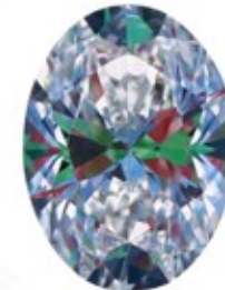
Optical Symmetry Good

The colored areas of the symmetry image are indications of light handling ability, giving a visual representation of proportions and facet alignment.