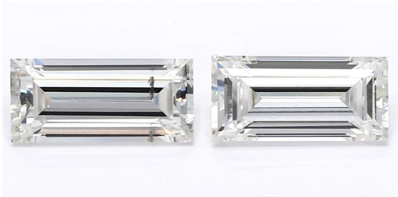
Matched Pair of Lab Grown Diamonds with a Total Weight of 0.51 ct(s)

*Comment: These man-made diamonds were grown in a laboratory and have the same chemical, physical, and optical properties as natural earth mined diamonds.