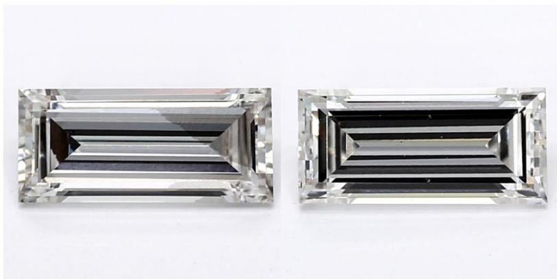
Matched Pair of Lab Grown Diamonds with a Total Weight of 0.63 ct(s)

*Comment: These man-made diamonds were grown in a laboratory and have the same chemical, physical, and optical properties as natural earth mined diamonds.