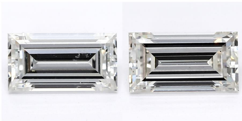
Matched Pair of Lab Grown Diamonds with a Total Weight of 0.68 ct(s)

*Comment: These man-made diamonds were grown in a laboratory and have the same chemical, physical, and optical properties as natural earth mined diamonds.