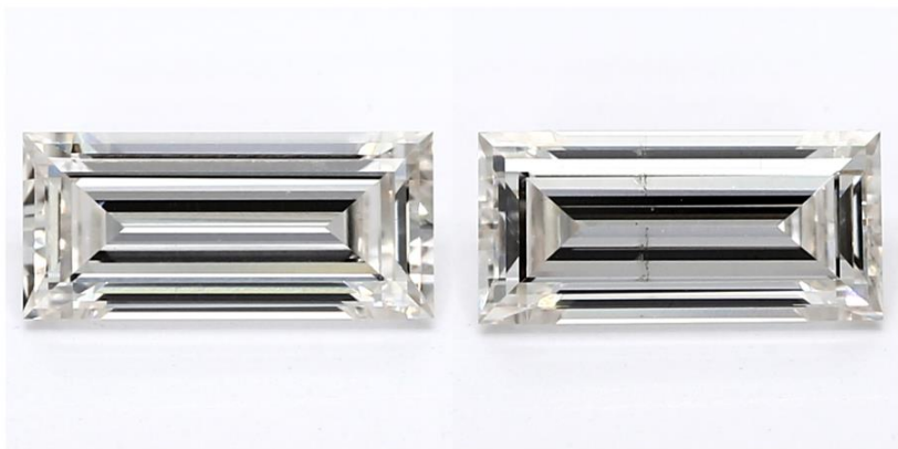
Matched Pair of Lab Grown Diamonds with a Total Weight of 0.67 ct(s)

*Comment: These man-made diamonds were grown in a laboratory and have the same chemical, physical, and optical properties as natural earth mined diamonds.