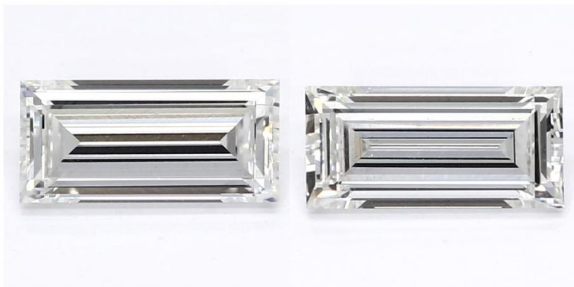
Matched Pair of Lab Grown Diamonds with a Total Weight of 0.70 ct(s)

*Comment: These man-made diamonds were grown in a laboratory and have the same chemical, physical, and optical properties as natural earth mined diamonds.