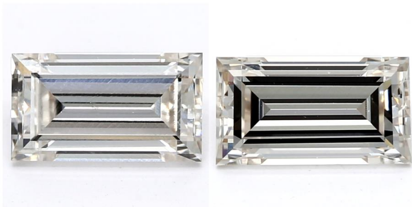
Matched Pair of Lab Grown Diamonds with a Total Weight of 1.02 ct(s)

*Comment: These man-made diamonds were grown in a laboratory and have the same chemical, physical, and optical properties as natural earth mined diamonds.