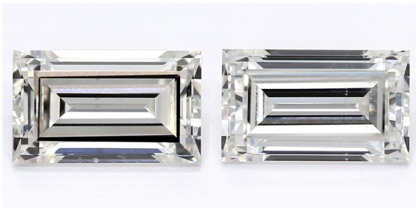
Matched Pair of Lab Grown Diamonds with a Total Weight of 1.06 ct(s)

*Comment: These man-made diamonds were grown in a laboratory and have the same chemical, physical, and optical properties as natural earth mined diamonds.