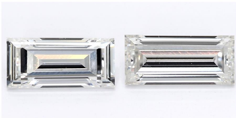
Matched Pair of Lab Grown Diamonds with a Total Weight of 1.04 ct(s)

*Comment: These man-made diamonds were grown in a laboratory and have the same chemical, physical, and optical properties as natural earth mined diamonds.