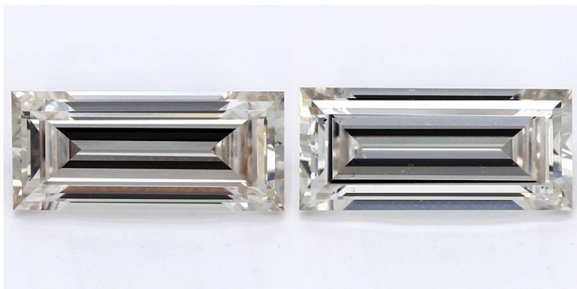
Matched Pair of Lab Grown Diamonds with a Total Weight of 1.42 ct(s)

*Comment: These man-made diamonds were grown in a laboratory and have the same chemical, physical, and optical properties as natural earth mined diamonds.