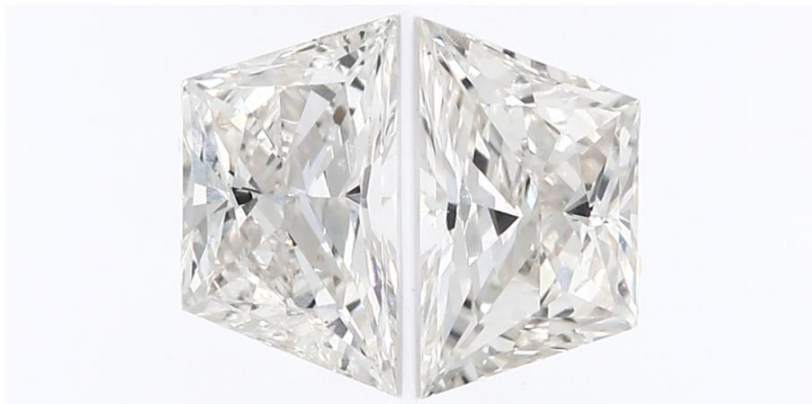
Matched Pair of Lab Grown Diamonds with a Total Weight of 0.70 ct(s)

*Comment: These man-made diamonds were grown in a laboratory and have the same chemical, physical, and optical properties as natural earth mined diamonds.