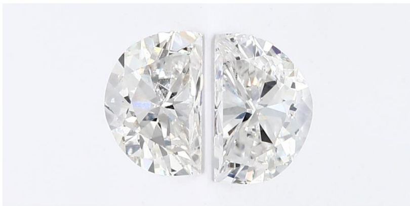
Matched Pair of Lab Grown Diamonds with a Total Weight of 0.56 ct(s)

*Comment: These man-made diamonds were grown in a laboratory and have the same chemical, physical, and optical properties as natural earth mined diamonds.