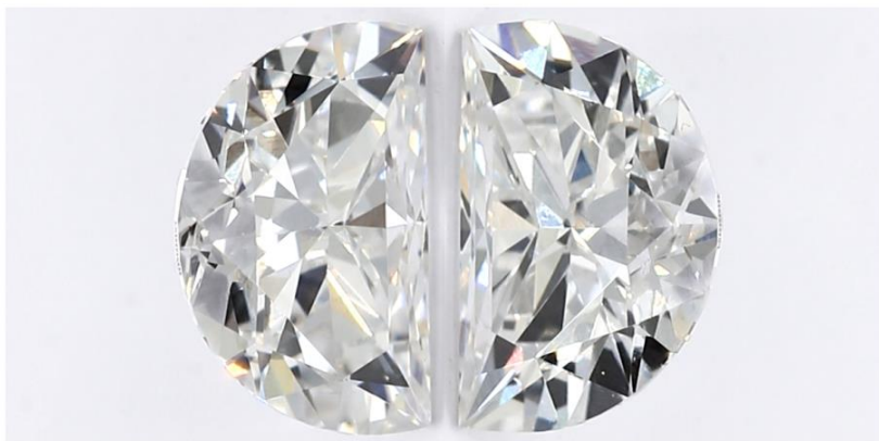
Matched Pair of Lab Grown Diamonds with a Total Weight of 1.04 ct(s)

*Comment: These man-made diamonds were grown in a laboratory and have the same chemical, physical, and optical properties as natural earth mined diamonds.