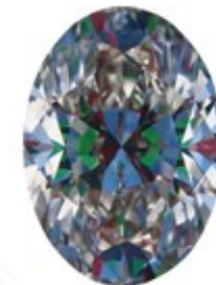
Optical Symmetry Good

The colored areas of the symmetry image are indications of light handling ability, giving a visual representation of proportions and facet alignment.