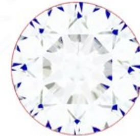
Optical Brilliance Excellent

Brilliance is the overall return of light to the viewer. The brilliance image is a representation of (a) white areas of light return, or brilliance, and (b) dark-blue areas of light loss.