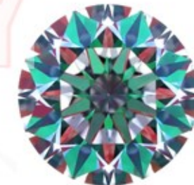
Optical Symmetry Excellent

The colored areas of the symmetry image are indications of light handling ability, giving a visual representation of proportions and facet alignment.