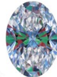
Optical Symmetry Very Good

The colored areas of the symmetry image are indications of light handling ability, giving a visual representation of proportions and facet alignment.