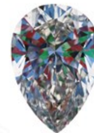
Optical Symmetry Good

The colored areas of the symmetry image are indications of light handling ability, giving a visual representation of proportions and facet alignment.