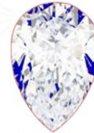
Optical Brilliance Excellent

Brilliance is the overall return of light to the viewer. The brilliance image is a representation of (a) white areas of light return, or brilliance, and (b) dark-blue areas of light loss.