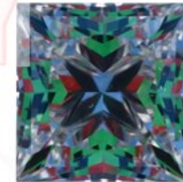
Optical Symmetry Good

The colored areas of the symmetry image are indications of light handling ability, giving a visual representation of proportions and facet alignment.