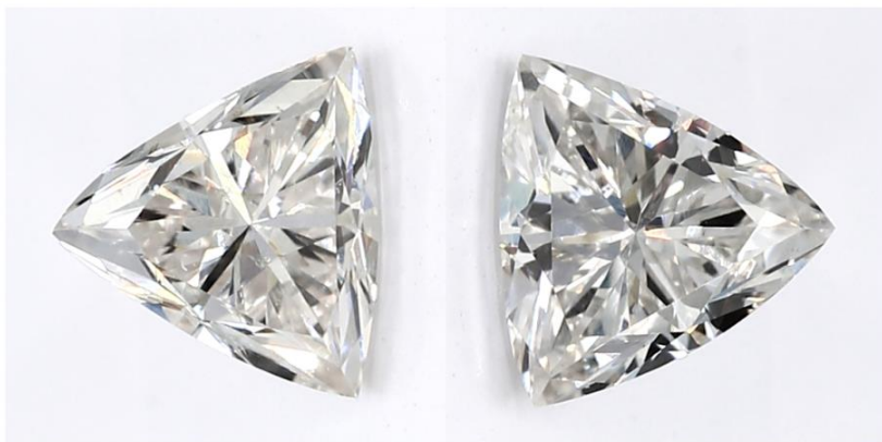
Matched Pair of Lab Grown Diamonds with a Total Weight of 0.69 ct(s)

*Comment: These man-made diamonds were grown in a laboratory and have the same chemical, physical, and optical properties as natural earth mined diamonds.