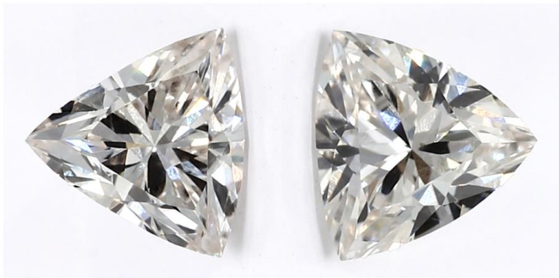
Matched Pair of Lab Grown Diamonds with a Total Weight of 0.76 ct(s)

*Comment: These man-made diamonds were grown in a laboratory and have the same chemical, physical, and optical properties as natural earth mined diamonds.