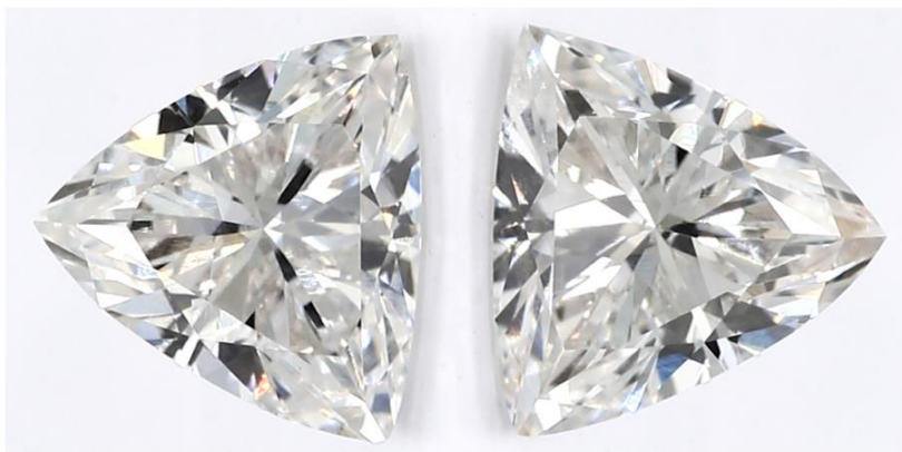
Matched Pair of Lab Grown Diamonds with a Total Weight of 1.04 ct(s)

*Comment: These man-made diamonds were grown in a laboratory and have the same chemical, physical, and optical properties as natural earth mined diamonds.