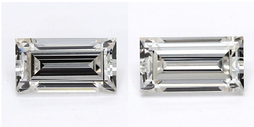
Matched Pair of Lab Grown Diamonds with a Total Weight of 0.47 ct(s)

*Comment: These man-made diamonds were grown in a laboratory and have the same chemical, physical, and optical properties as natural earth mined diamonds.