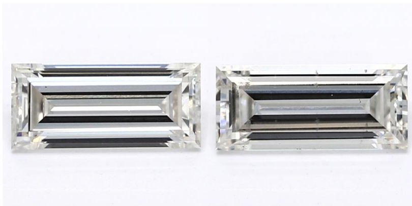
Matched Pair of Lab Grown Diamonds with a Total Weight of 0.61 ct(s)

*Comment: These man-made diamonds were grown in a laboratory and have the same chemical, physical, and optical properties as natural earth mined diamonds.