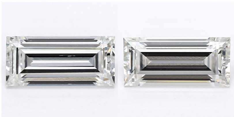
Matched Pair of Lab Grown Diamonds with a Total Weight of 0.61 ct(s)

*Comment: These man-made diamonds were grown in a laboratory and have the same chemical, physical, and optical properties as natural earth mined diamonds.