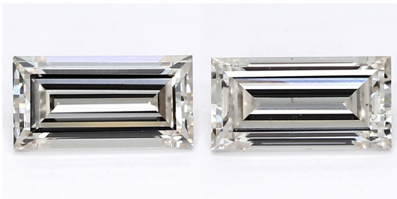
Matched Pair of Lab Grown Diamonds with a Total Weight of 0.62 ct(s)

*Comment: These man-made diamonds were grown in a laboratory and have the same chemical, physical, and optical properties as natural earth mined diamonds.