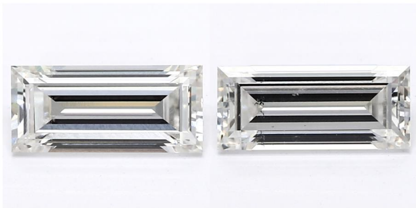
Matched Pair of Lab Grown Diamonds with a Total Weight of 0.66 ct(s)

*Comment: These man-made diamonds were grown in a laboratory and have the same chemical, physical, and optical properties as natural earth mined diamonds.