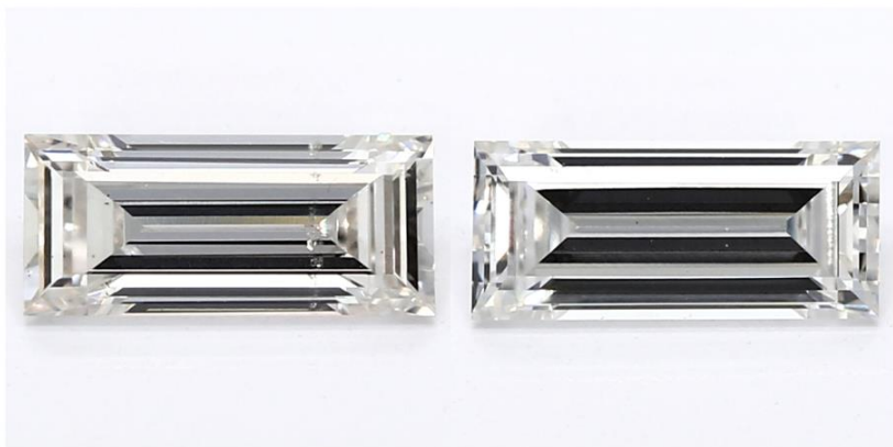
Matched Pair of Lab Grown Diamonds with a Total Weight of 0.65 ct(s)

*Comment: These man-made diamonds were grown in a laboratory and have the same chemical, physical, and optical properties as natural earth mined diamonds.