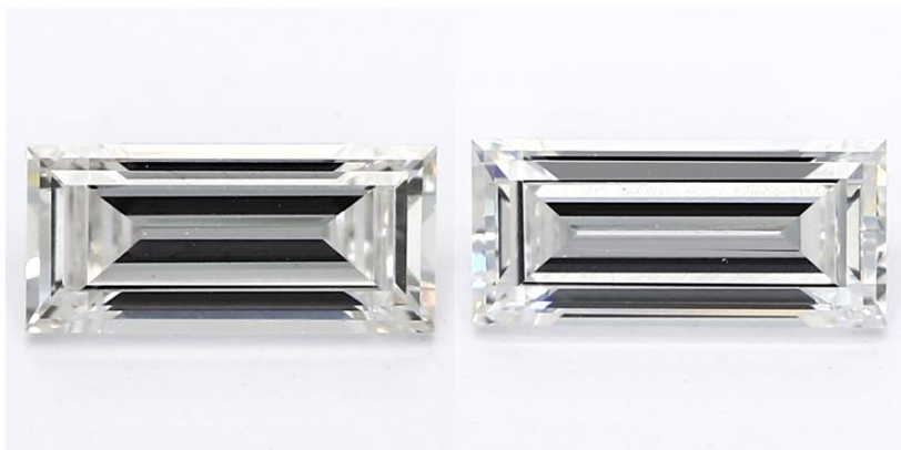
Matched Pair of Lab Grown Diamonds with a Total Weight of 0.68 ct(s)

*Comment: These man-made diamonds were grown in a laboratory and have the same chemical, physical, and optical properties as natural earth mined diamonds.