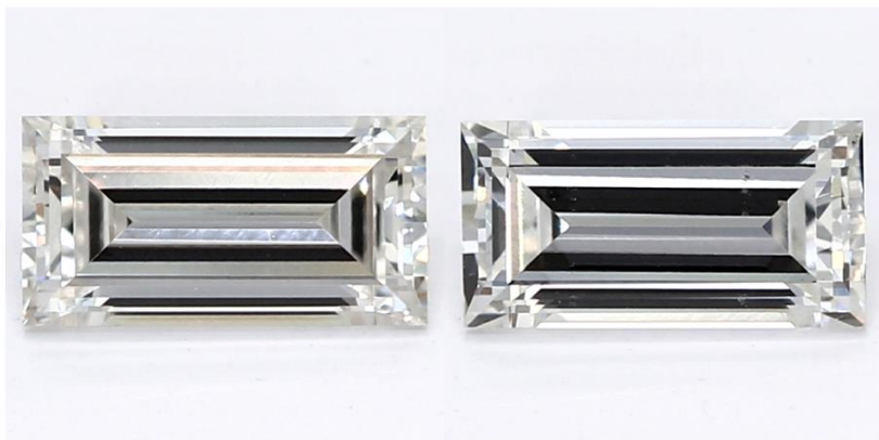
Matched Pair of Lab Grown Diamonds with a Total Weight of 0.66 ct(s)

*Comment: These man-made diamonds were grown in a laboratory and have the same chemical, physical, and optical properties as natural earth mined diamonds.