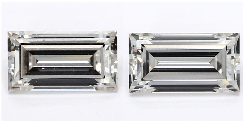
Matched Pair of Lab Grown Diamonds with a Total Weight of 0.68 ct(s)

*Comment: These man-made diamonds were grown in a laboratory and have the same chemical, physical, and optical properties as natural earth mined diamonds.