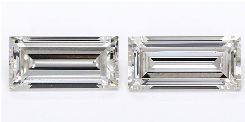
Matched Pair of Lab Grown Diamonds with a Total Weight of 0.68 ct(s)

*Comment: These man-made diamonds were grown in a laboratory and have the same chemical, physical, and optical properties as natural earth mined diamonds.