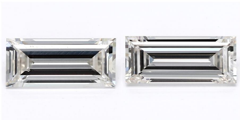
Matched Pair of Lab Grown Diamonds with a Total Weight of 0.70 ct(s)

*Comment: These man-made diamonds were grown in a laboratory and have the same chemical, physical, and optical properties as natural earth mined diamonds.