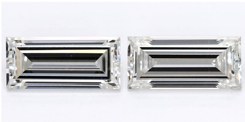
Matched Pair of Lab Grown Diamonds with a Total Weight of 1.03 ct(s)

*Comment: These man-made diamonds were grown in a laboratory and have the same chemical, physical, and optical properties as natural earth mined diamonds.