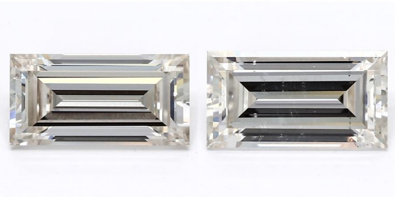
Matched Pair of Lab Grown Diamonds with a Total Weight of 1.06 ct(s)

*Comment: These man-made diamonds were grown in a laboratory and have the same chemical, physical, and optical properties as natural earth mined diamonds.