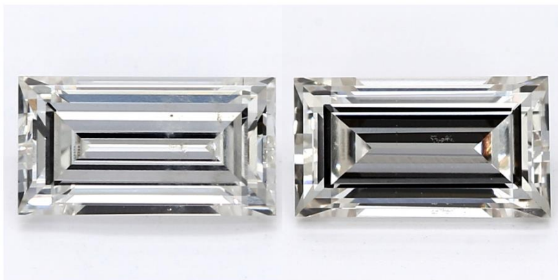
Matched Pair of Lab Grown Diamonds with a Total Weight of 1.05 ct(s)

*Comment: These man-made diamonds were grown in a laboratory and have the same chemical, physical, and optical properties as natural earth mined diamonds.