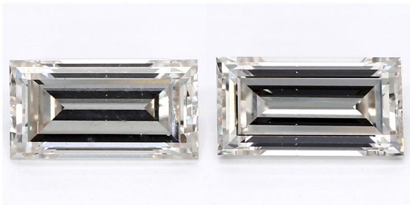
Matched Pair of Lab Grown Diamonds with a Total Weight of 1.07 ct(s)

*Comment: These man-made diamonds were grown in a laboratory and have the same chemical, physical, and optical properties as natural earth mined diamonds.