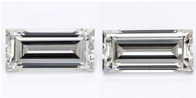
Matched Pair of Lab Grown Diamonds with a Total Weight of 1.09 ct(s)

*Comment: These man-made diamonds were grown in a laboratory and have the same chemical, physical, and optical properties as natural earth mined diamonds.