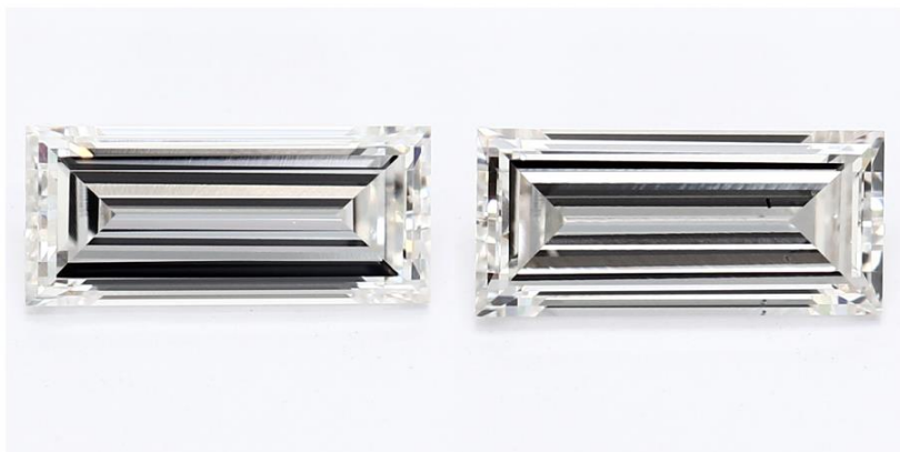
Matched Pair of Lab Grown Diamonds with a Total Weight of 1.43 ct(s)

*Comment: These man-made diamonds were grown in a laboratory and have the same chemical, physical, and optical properties as natural earth mined diamonds.