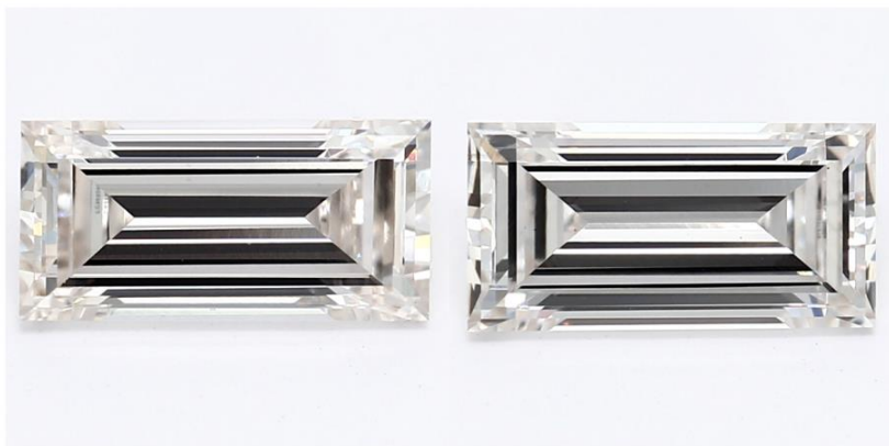
Matched Pair of Lab Grown Diamonds with a Total Weight of 1.56 ct(s)

*Comment: These man-made diamonds were grown in a laboratory and have the same chemical, physical, and optical properties as natural earth mined diamonds.